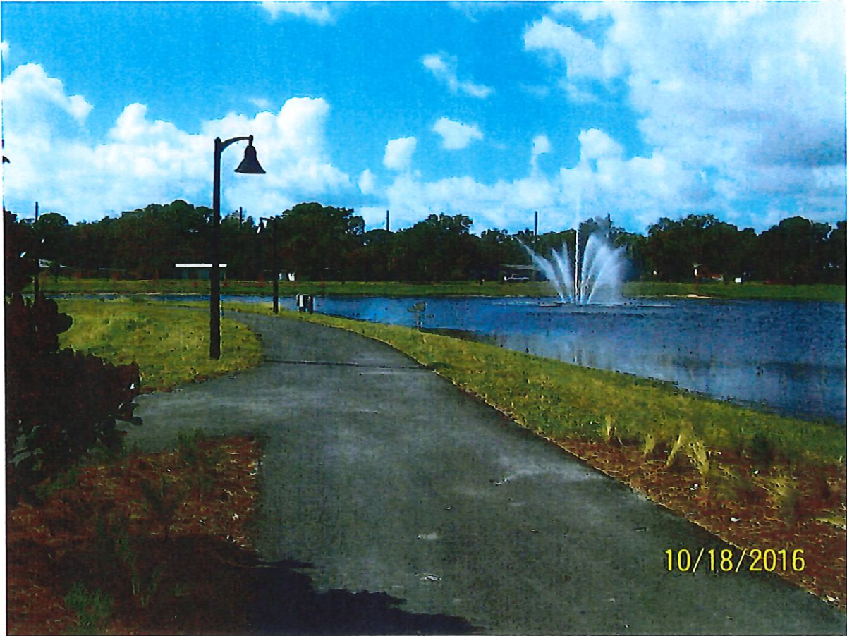
(Draa Field Stormwater Park – Titusville FL)