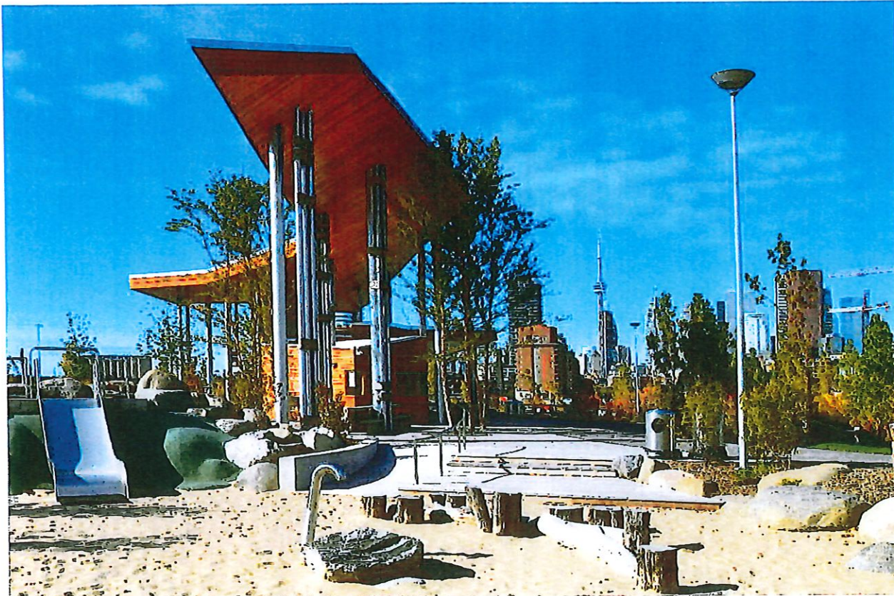
(Corktown Common Park – Toronto, Ontario)