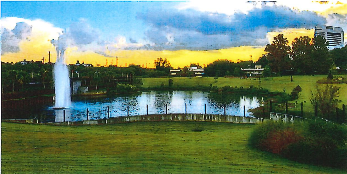
(Cascades Park – Tallahassee, FL)